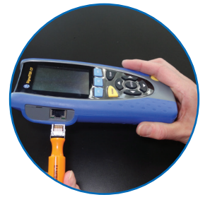
Replaceable RJ45 contacts